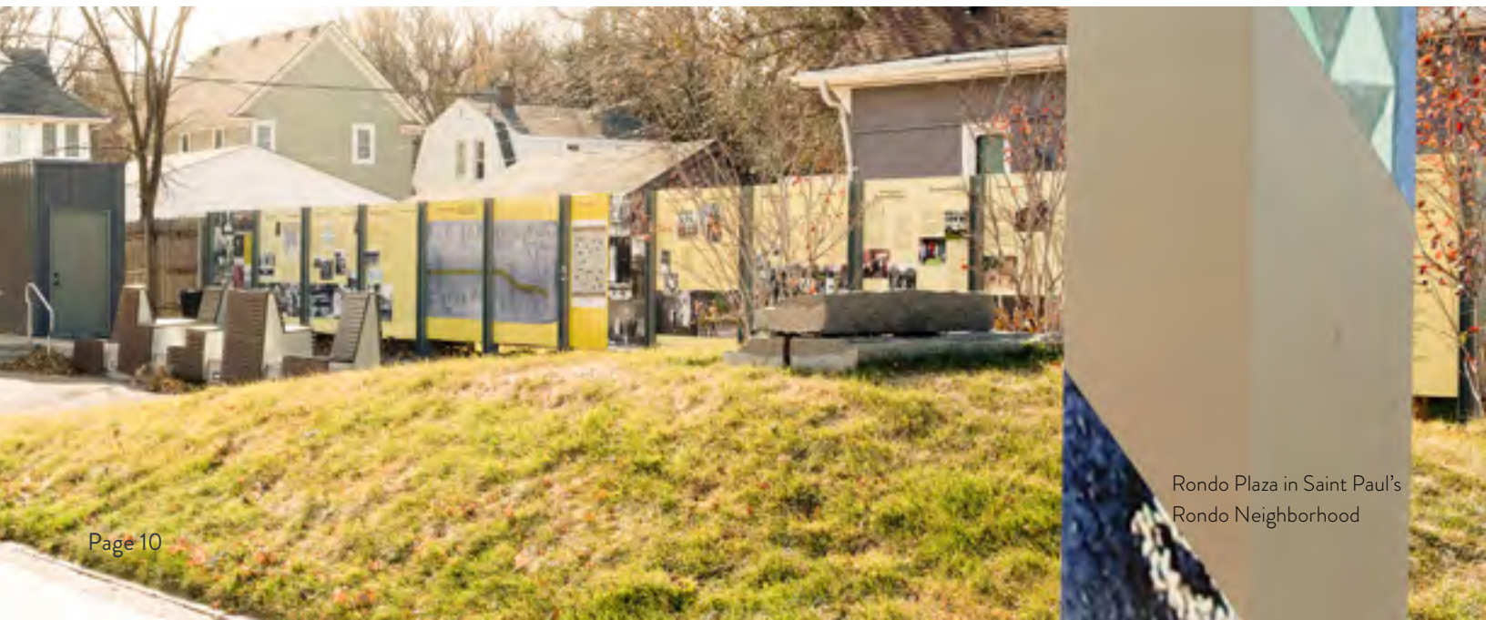
Rondo Plaza in Saint Paul's Rondo Neighborhood