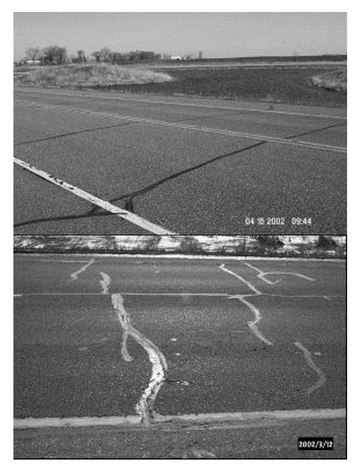
Figure 2. Typical thermal cracking patterns on PG 58-28 (top) and PG 64-22 (bottom) test cells at MnROAD (Clyne et al. 2006).

In addition to noting important environmental and material data along with their observations, from the outset MnROAD engineers have recorded these observations in light of possible research topics: for instance, MnROAD proposed the necessity of load-related inputs for thermal cracking models by observing that in many cases more thermal cracks developed in the right (driving) lane than in the left (passing) lane in the mainline sections. A number of test section assessment reports by Palmquist, Worel et al., Palmquist et al., and Zerfas describe in detail the damage done by the Minnesota's climatic extremes.